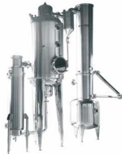
Single effect concentrator