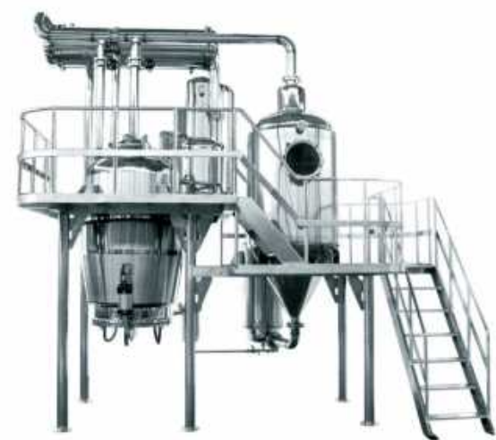
Multifunctional reflux extractor and concentrator machine