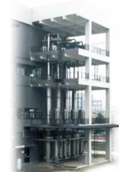
Continuous distillation alcohol rectification column