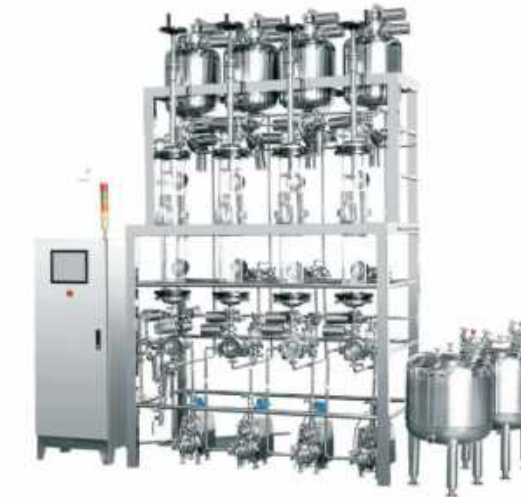
Auto-control multi-countercurrent resin column group