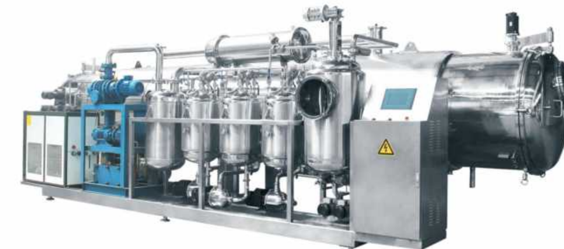
WXDG Vacuum belt drying machine