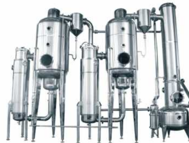
Double effect concentrator