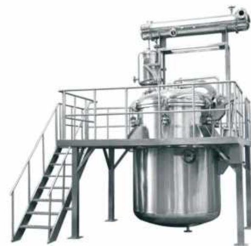
Filtration type extraction tank