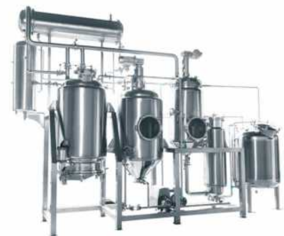
Multifunctional miniature extractor and concentrator machine