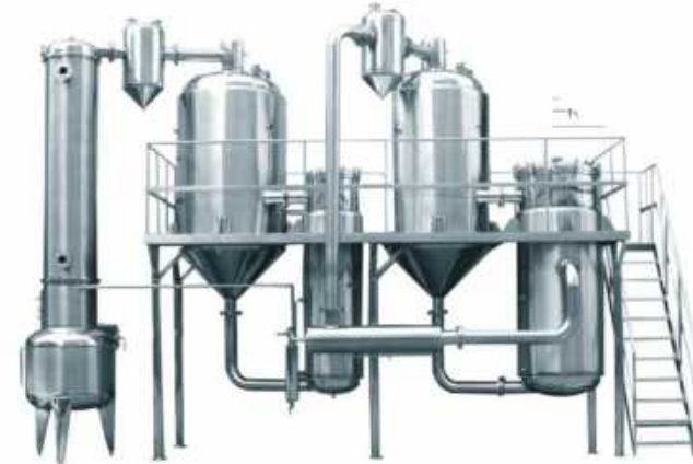
External heating double-effect concentrator with thermal compressor